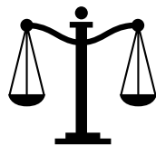
Courts of Law

Whether before the legislature, the court of law, the court or public opinion, or at the ballot box, the Florida Chamber of Commerce is leading the fight to improve Florida's bottom-five legal climate . The General Counsels Council focuses on moving the needle across four battlefields and advise the Florida Chamber Litigation & Regulatory Reform Center's effort to enact meaningful change. There are more trial lawyer billboards urging frivolous litigation in Florida than anywhere else in the world. The need for a united business community guided by Florida's leading General Counsels to advocate the reforms necessary to meet Florida's competitive potential is paramount.