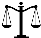
Courts of Law

Whether before the legislature, the court of law, the court or public opinion, or at the ballot box, the Florida Chamber of Commerce is leading the fight to improve Florida's bottom-five legal climate. The General Counsels Council focuses on moving the needle across four battlefields and advise the Florida Chamber Litigation & Regulatory Reform Center's effort to enact meaningful change. There are more trial lawyer billboards urging frivolous litigation in Florida than anywhere else in the world. The need for a united business community guided by Florida's leading General Counsels to advocate the reforms necessary to meet Florida's competitive potential is paramount.