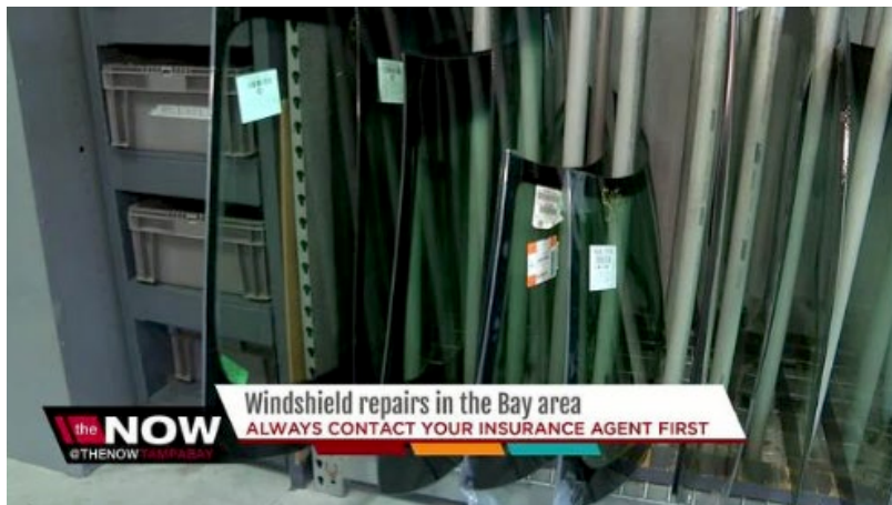
Tampa Bay is ground-zero for assignment of benefits cases over broken auto glass