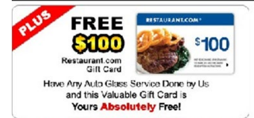
Advertisements on the Auto Glass America Website, Aug. 15, 2015