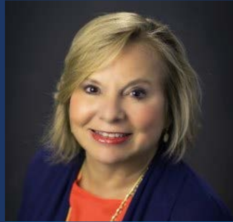
Commissioner Kathryn Starkey