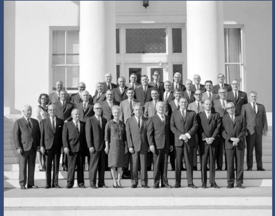
Pictured above: Authors of the Current Florida Constitution, 1968

To learn more, visit www.FloridaChamber.com/CRC